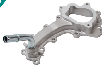
P/N 86336 VIO 893,302 (23-18) Jeep Wrangler (23-19) RAM 1500 Series