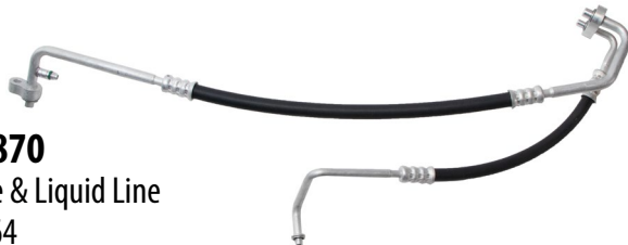
P/N 65870 Discharge & Liquid Line VIO 91,764 (21-17) Chevrolet Bolt