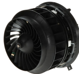
P/N 76538 VIO 954,608 (22-16) Mercedes C300 / C300d (22-19) E450