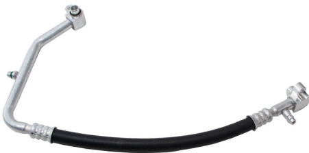
P/N 65880 Suction Line VIO 67,421 (19-16) Chevrolet Volt