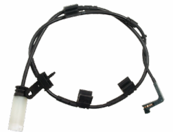
Mini Cooper WS384