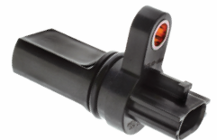
Nissan Camshaft Sensor CSS1464