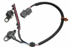
Honda Crankshaft Sensor CSS596