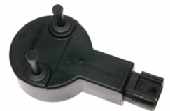
Ford Camshaft Sensor CSS149