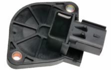
Chrysler Camshaft Sensor CSS1600