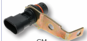
GM Crankshaft Sensor CSS123