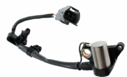
Toyota Crankshaft Sensor CSS839