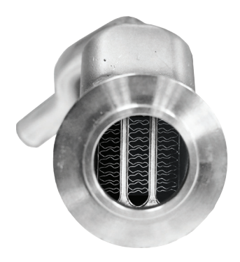
OE Design: Fin-and-tube Effect: Although this design is efficient, it's prone to soot clogging and internal leaks from fractures caused by overheating