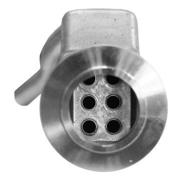
Competitor A Design: 6 spiral tubes Effect: Exhaust gas temperatures that are hundreds of degrees hotter than OE specs, which can reduce the life expectancy of the EGR valve, engine valves, and head gaskets.