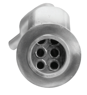
Competitor B Design: 6 straight tubes Effect: The straight tubes are less efficient than spiral tubes, which creates even hotter exhaust gas temperatures than Competitor A